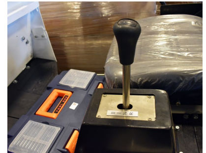
Two Speed Automatic Shifter