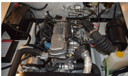
Nissan K25 Engine Gasoline 2.5l 4 Cylinder 2500 RPM 60 HP Made in Japan