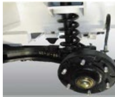
Smart independent front suspension