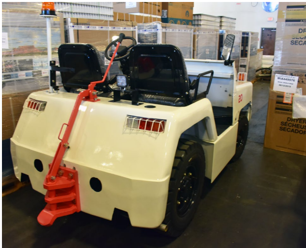
Two-Stage Towing Bar