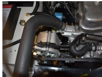
Graziano Transmission Made in Italy