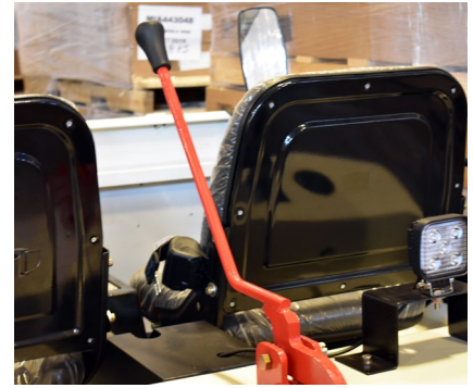
Easy driver control Two-Stage Towing